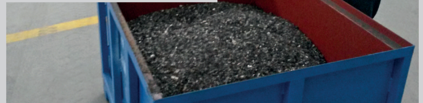
Metal concentrate after pyrolysis

Schematic diagram of sampling by means of triplicate sample divider