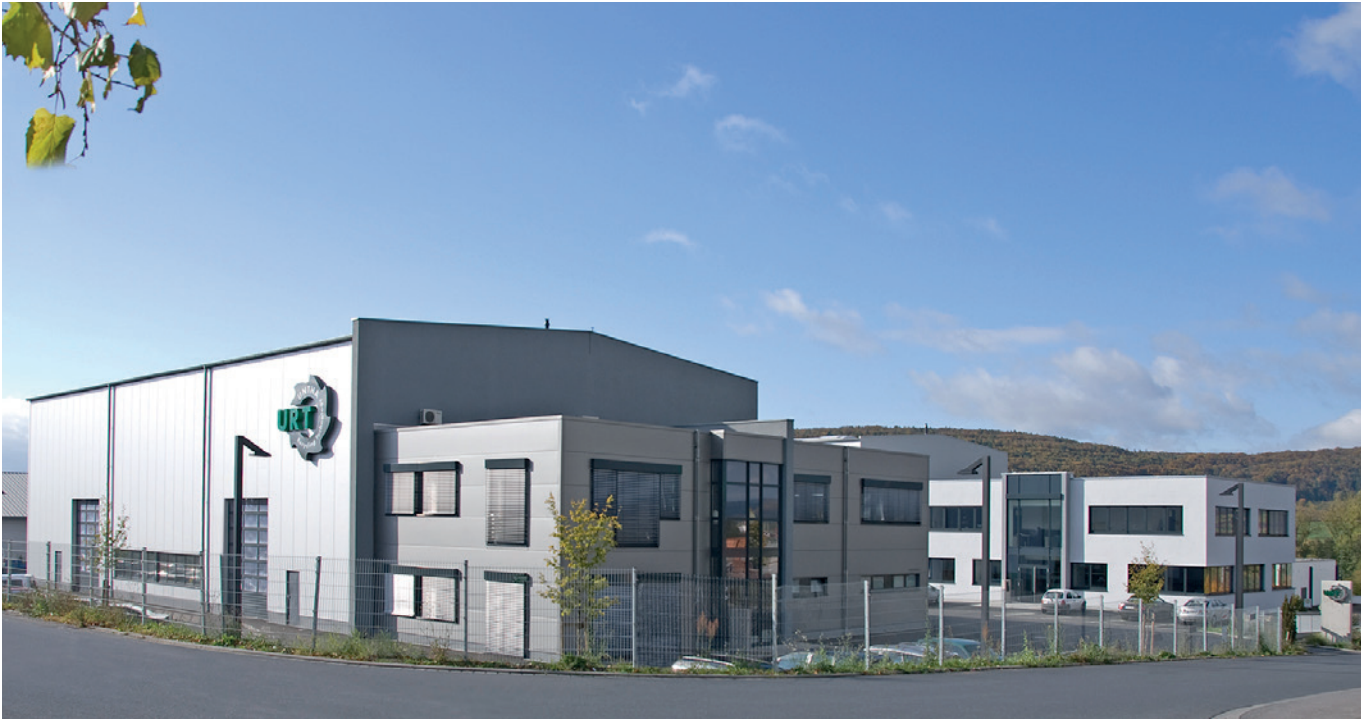
Factory Karlstadt, Germany

One-stop planning, production, delivery and service